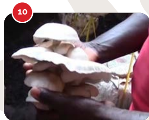
The mushrooms start sprawling 3 to 5 days after hanging and will be ready for harvest. You can dry and package the mushrooms or sell them fresh.