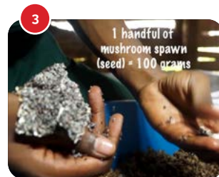
Start the inoculation, adding spawn (seeds) to substrate. 3 Mix the 100g of spawn with 2 kg of substrate to make 1 garden. Ensure to disseminate the spawn fully in the substrate. 100g is roughly a handful.

Step 1 - Wet sterilization: Mix the substrate with water in a basin until it is wet but not soaked. 2 Step 2 - Steam sterilization: Pour 20 liters of water in the drum and place a rice sack with substrate in the water. Heat the water to allow steam to pass through the substrate in the garden sack. Steam for 3-4 hours and let cool for 1-2 hours.