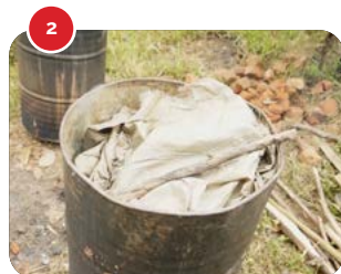
Take substrate through a two-step sterilization process.

Step 1 - Wet sterilization: Mix the substrate with water in a basin until it is wet but not soaked. 2 Step 2 - Steam sterilization: Pour 20 liters of water in the drum and place a rice sack with substrate in the water. Heat the water to allow steam to pass through the substrate in the garden sack. Steam for 3-4 hours and let cool for 1-2 hours.